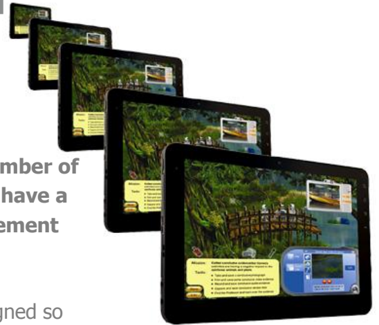
LearnPad Management Portal

In addition to these requirements, the system has been designed so that no specialised knowledge of mobile devices or device manage is required to successfully utilise the system. The interface has been designed in a simplified way to ensure it can be used by a range of personnel with varying levels of ICT skills. Moreover, the solution has been customised to best fit an educational institution and its unique requirements, including network share access and individual profiling.